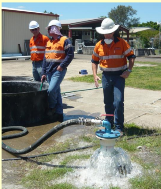
Displacing the water with cement grout