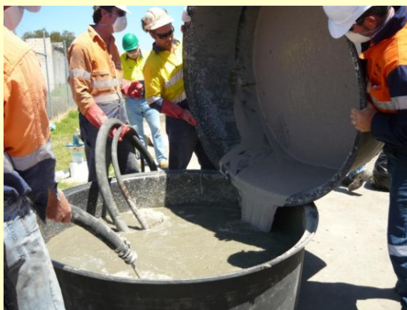
Getting the last of the hydrated bentonite into the cement mix.

Contact ADITC to register interest in participating in future courses.